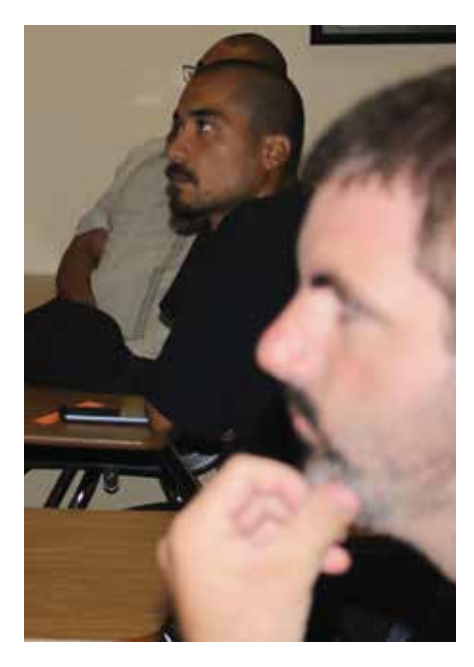
Building Brighter Future participants (above) learn valuable life and parenting skills using Love Notes relationship curriculum.

This is the final article in the 2015 Partnering For Impact series.